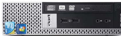
Figure 2 Smart classroom computer

The CSCC smart classroom contains a Dell OptiPlex 7040 or similar model computer (Figure 2). The initial step for a user entering the classroom is to power on the computer (if necessary) and log on to the computer. Logging on to the computer first will allow for seamless transitions when using the other equipment. The power button is located in the top right corner of the computer tower.