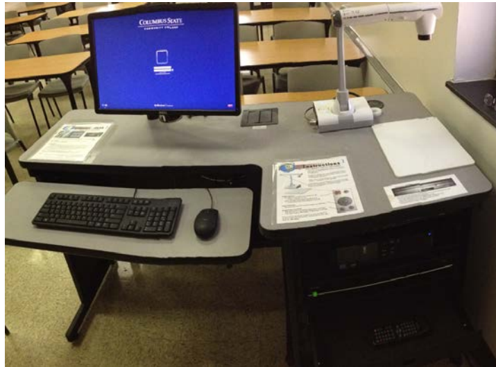
Figure 1 Smart Classroom instructor's desk

Standard equipment in a smart classroom on the CSCC campus are: computer, data projector, DVD/VCR unit, document camera, laptop connection, and a wall panel used to display each unit (Figure 1). The equipment is housed in the instructor's desk located at the front of the classroom. The computer monitor is mounted to an adjustable arm that can accommodate sitting or standing instruction. The computer's keyboard rests on an adjustable tray that also accommodates sitting or standing.