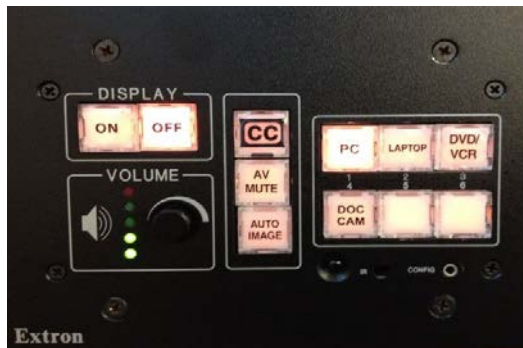
Figure 6 Smart Classroom Extron Control Panel in the powered off state; PC is selected as the current display

The Extron control panel (Figure 6) is the control panel for controlling audio/video equipment displays in Columbus State Community College's smart classrooms.