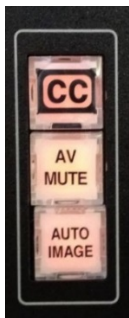
Figure 10 Image and Closed Caption controls

IMAGE AND CLOSED CAPTION CONTROLS. The image and Closed Caption controls are located to the right of the display power and volume controls. The three buttons in this section control Closed Captioning, if available, AV mute, and auto image buttons (Figure 10).