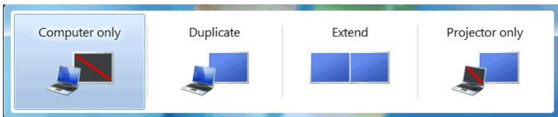
Figure 84 Selection Menu with Computer only Option displayed

To properly use the Windows +P shortcut keystroke, the user must press and hold down the “Windows” button. While holding down the “Windows” button, the user must then press the “P” key. This will bring up a menu (Figure 14) that will allow the user to select the desired display function. To operate the menu the user may use either the mouse to select the function or the arrow keys on the keyboard. Note: if using the arrow keys, when the desired display function is highlighted, the user must then press the “Enter” key to finalize the selection.