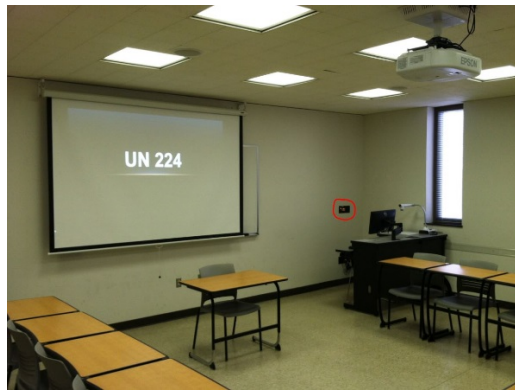
Figure 62 Standard Smart Classroom – Extron panel location

The Extron control panel will be located on the wall behind the instructor's desk in the smart classroom (Figure 12).