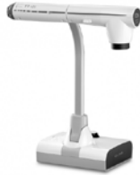
Figure 3 Elmo TT-12i Document Camera

The document camera in the smart classroom is an Elmo TT-12i Interactive Document Camera (Figure 3). It functions like a webcam as it is a camera that may be used to display images through the data projector. *note: not all Smart Classrooms are equipped with a document camera.