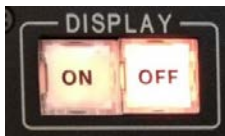
Figure 8 Display in the powered off state

DISPLAY POWER CONTROLS. Located in the top left section of the Extron control panel, the display power controls are two buttons labeled “on” and “off” which are used to turn on and off the mounted data projector (Figure 8).