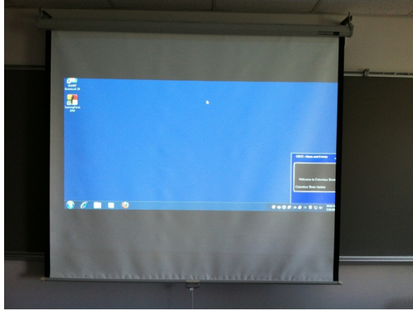
Figure 17 Projector displaying half image