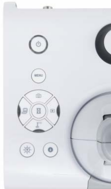
Figure 4 Document camera power button location

The camera must be powered on to display images. The power button is located on the base of the camera just above the “menu” button (Figure 4).