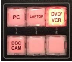
Figure 11 Display switches with DVD/VCR selected as the current display

DISPLAY SWITCHING CONTROLS. The right side of the Extron control panel contains the six display switching control buttons. In a standard smart classroom, only four of the six buttons will be labeled for use (Figure 11).