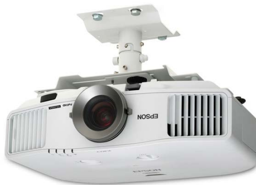
Figure 7 Mounted Data Projector (epson.com)

The panel works in conjunction with the mounted data projector (Figure 7) as it standardizes the controls for all technical equipment in the classroom allowing for easy switching of displays. The panel's illuminated button controls makes it convenient for the user to see what device is currently being displayed. Because the buttons illuminate, they are helpful for presenters in low-light environments (extron.com).