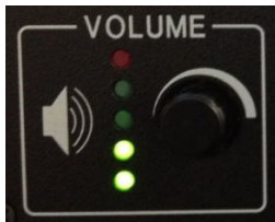
Figure 9 Volume level in the moderate/low state

VOLUME CONTROL. Located below the display power controls, in the bottom left section of the Extron control panel, the volume control contains a knob and LED lights to indicate the current volume level (Figure 9).